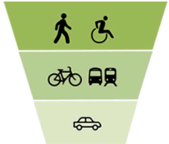
Complete Streets modal priority framework